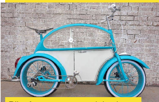
Bike for anyone nostalgic about the demise of the VW Beetle