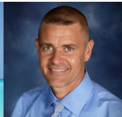
Proud Member St Pete Mad Dogs Multi Ironman Finisher

My proven strategies get your home sold fast at the best possible price.